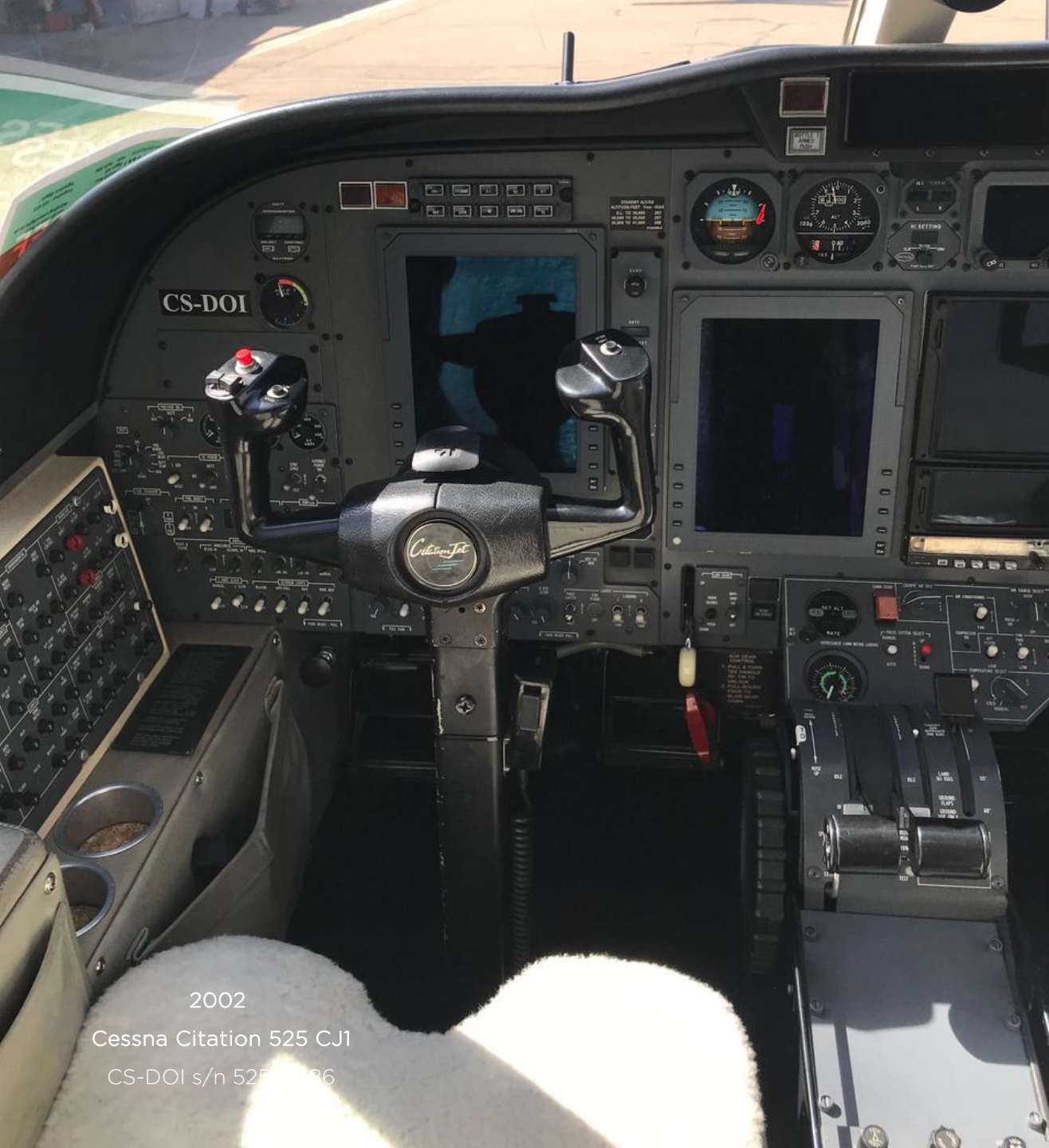
2002 Cessna Citation 525 CJ1 CS-DOI s/n 525-0486