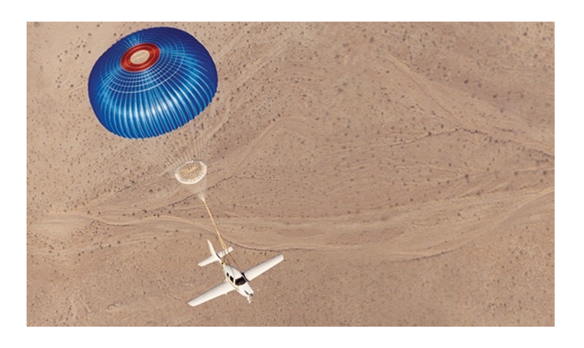
"Flying safely will always be our most fundamental mission"